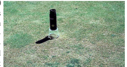
A heat-stressed green infected with anthracnose.

The summer of 2010 may be remembered as the hottest summer in history, but, in all honesty, does it really matter? This summer turned hot early, stayed hot throughout, and recorded a few more 90 degree days in September.