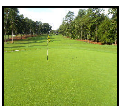
You can always tell it is fall by the long shadows of the lower sun angle. The atmosphere is cooling, the leaves are starting to drop, and there is a chill in the air. It feels pretty good after the sweltering heat of the summer here in the Mid-Atlantic Region.

This type of weather change occurred in the middle of August this year, when recordbreaking summer heat finally broke. Temperatures moderated, and in most parts of the country it began to rain and cool down. As a side note, it kept raining and raining, and it still is raining in some areas.