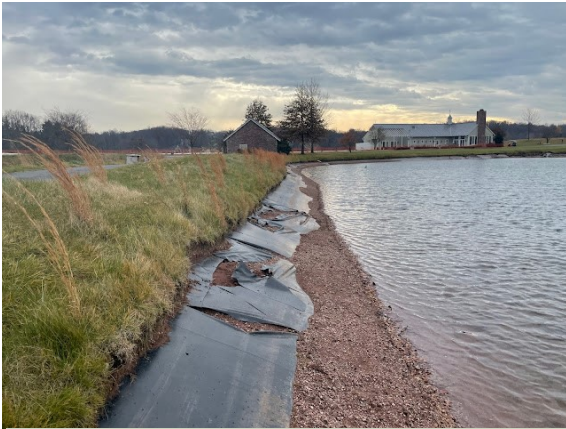
The old pond liner and erosion on 14 pond

The edge of the irrigation pond had been eroding over the last couple of years to the point where it needed reinforcing. While researching the best option, we were able to source some huge boulders locally, which will provide the best aesthetic solution to reinforce the banks. The plan was to excavate the old edge, build a shelf to place the boulders on, and then backfill behind them. Once the shelf was built (and the weather cooperated) we contacted the pond liner contractor to install the liner, only to find out it had been backordered. We had anticipated a delay so ordered it last fall to make sure it was here, however, as with it seems everything this year, we are at the mercy of the shipping companies. It is now supposed to be installed by mid-April, so hopefully this is the last delay. The rest of the project should only take a couple of weeks to complete once the liner is in place.