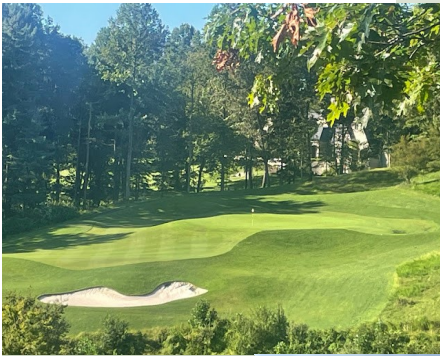
Slight bunker wash-out on new bunker on 17 from Hurricane Ida showing how well the liners work preventing washouts while keeping the sand clean even after more than 6" of rain