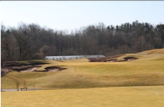
New bunkers shaped on 15 LedgeRock Golf Club

the other part remains similar to the old version. They are also lowering the front edge so there will be more sand visible from the fairway, making it aesthetically better and more visually intimidating, while also making it a little easier!