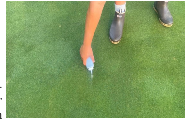
A 12-ounce condiment bottle containing a multicolored sand can help mask ball mark issues.