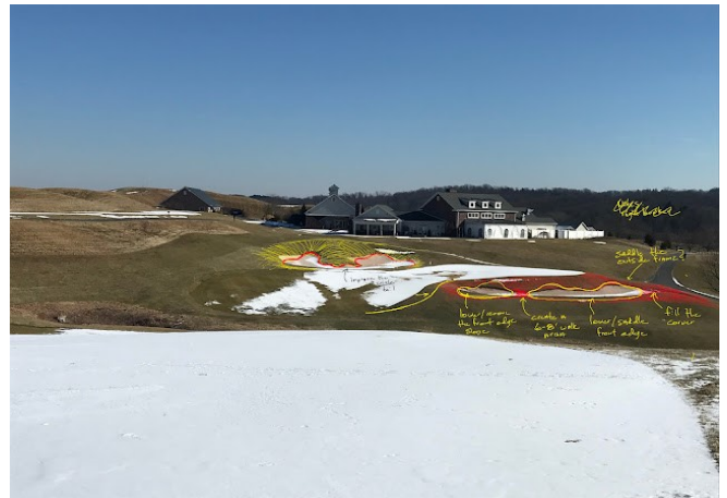
Quick sketch from Rees Jones showing the changes on 18 LedgeRock Golf Club

A perfect example of what we are doing, is on 18. The left bunker is getting tweaked to fit into the land better but also the front edge is getting lowered so there will be more sand visible from the fairway – one of the architect tricks to make it look bigger, when it will actually be smaller. The front bunker gets broken into two, with the smaller part nearer the approach being raised so you can now see the greens surface from it, while