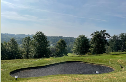
New fairway bunker on 12 showing the liner (Blinder) and edge structure (EcoBunker)

Now that the course is approaching its third decade, the club contacted Rees Jones so, as part of the reconstruction, they can make any changes needed to ensure the design continues to challenge into the future. The added benefit of this is that we can reduce the sand area, which will save money on maintenance in the future. It is amazing how architects can reduce sand area but without affecting the visuals and playability, so I cannot wait to see the finished product.