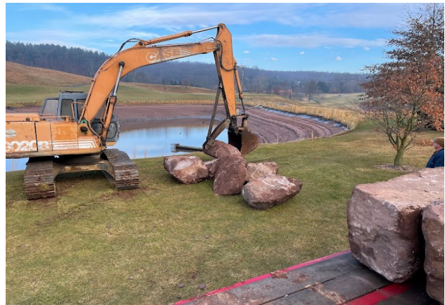
Unloading the boulders LedgeRock Golf Club

As you know, the board approved the greenside bunkers to be replaced this spring. The recommended life of bunker and is approximately seven years, so the 17-year-old sand at LedgeRock is well past its sell by date. The rebuilt bunkers will be constructed using the best method/materials available; this will ensure that the money spent now will pay off in the long term as it virtually reduces all contamination of the sand, ensuring that the new bunkers will greatly exceed the current recommended life span. We have sourced an excellent bunker sand to complement the project.