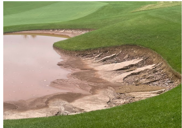
Bunker washouts from 6+” of rain from Hurricane Ida Sept 2021