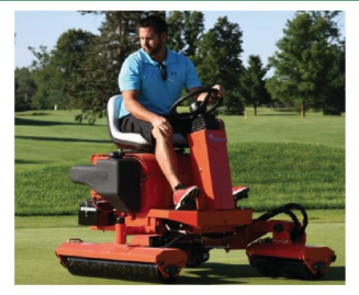
Smithco XL 7000 Greens Roller

Steiner 450 Tractor w/ Flex Deck Mower Precision cuts on steep slopes and attachments for all year long.