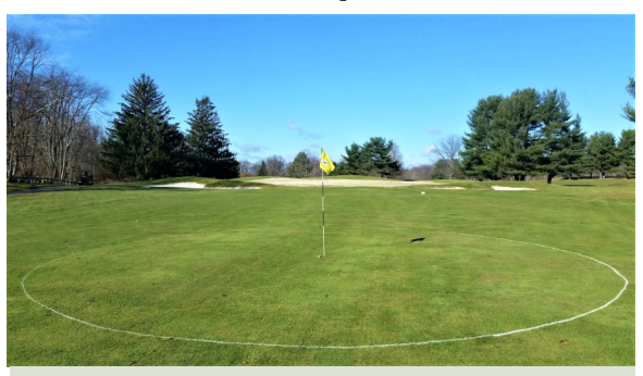
age on the primary greens while providing golfers a

Spirited debates about the risks associated with allowing golfers to play on the greens Temporary greens reduce the potential for turf damduring winter have occurred for decades and are likely to continue for years to come. chance to play during winter. When determining if the greens should be