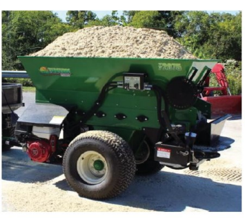
Top Dresser Greens and Fairway Top Dressers