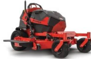
Gravelly Pro-Stance 60