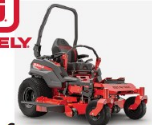
Gravelly Pro-Stance EV 48"