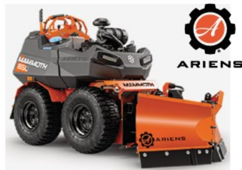
Ariens Mammoth Snow Machine