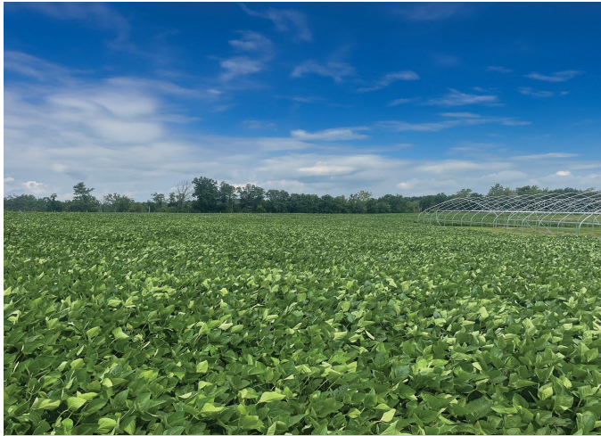
This is what soybeans look like when planted into a creeping bentgrass fairway.

Don't it always seem to go That you don't know what you've got 'til it's gone. The paved paradise, put up a parking lot.