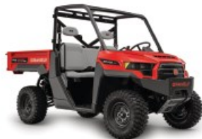
Gravelly ATLAS JSV