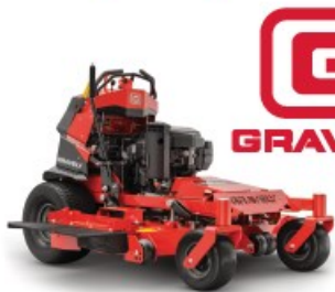
Gravelly Pro-Stance EV 48"