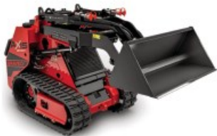
Gravelly AXIS Utility Loader