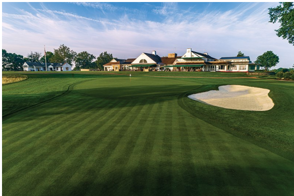
Lancaster Country Club in Lancaster, Pa., is home to this month's U.S. Women's Open.